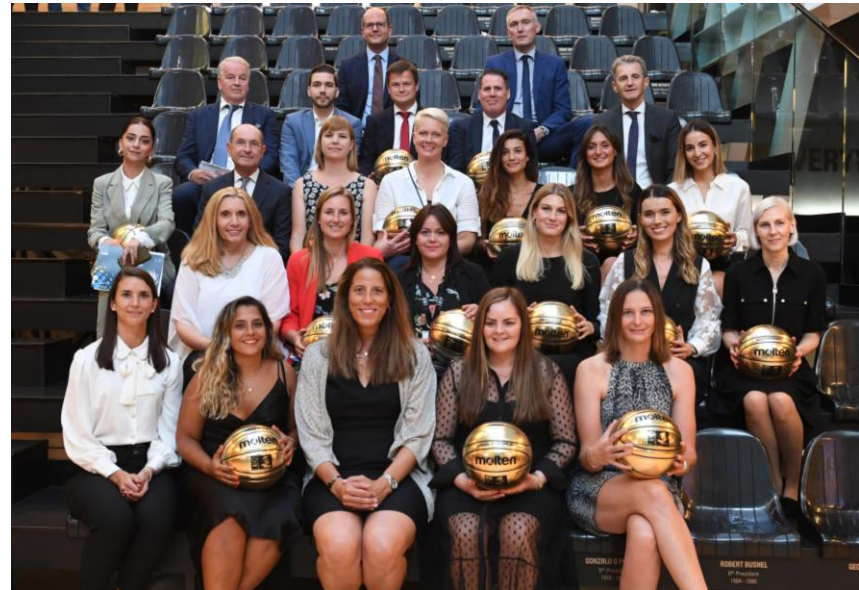
WiLEAD – Cohort 1