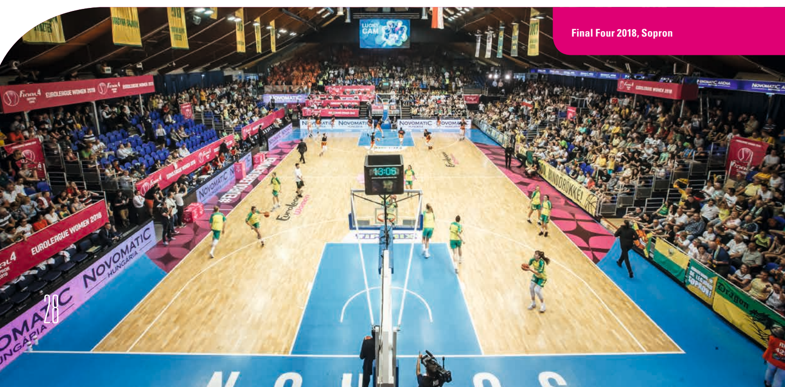
Final Four 2018, Sopron

So, we are not just parachuting into Sopron for a one-off weekend, because if you love women's basketball, you can normally catch tournaments throughout the calendar year. It is something that proves what a hotbed of women's basketball this is – at all levels!