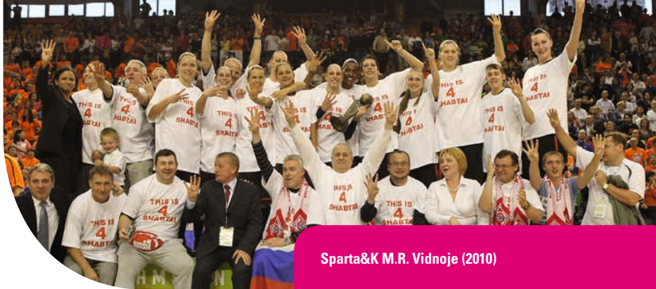
Sparta&K M.R. Vidnoje (2010)

ONE OF THE MOST RESPECTED AND RENOWNED COMPETITIONS IN THE SPORT, EURO-LEAGUE WOMEN HAS A PROUD TRADITION OF PRODUCING SOME INCREDIBLE GAMES, MEMORIES AND EXCITEMENT FOR FANS AND THOSE INVOLVED.